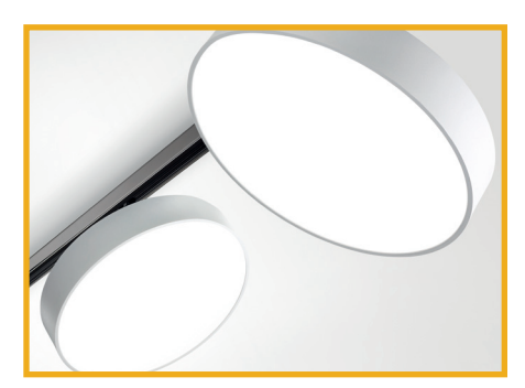
Lighting Equipment, not elsewhere classified (S1C Code 3648)