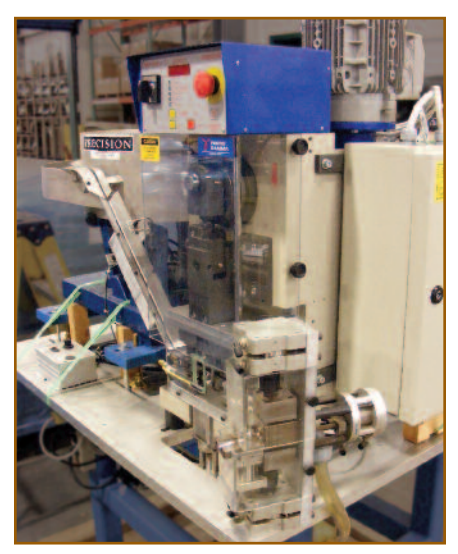
Heyco Female Bridge Machine (see page 8-60)